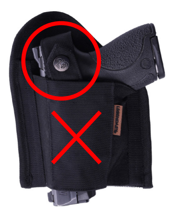
Straps misaligned on firearm