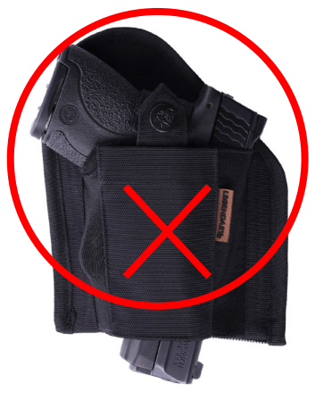
Firearm placed in holster backward