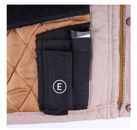
Pocket Pistol Magazine