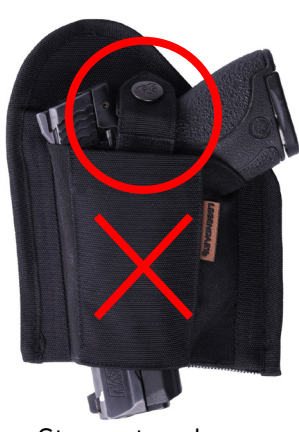
Straps too loose around firearm