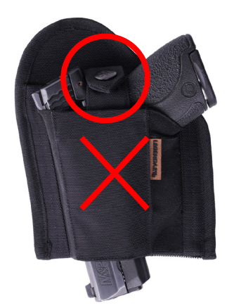
Straps placed backward and snap placed too high on firearm