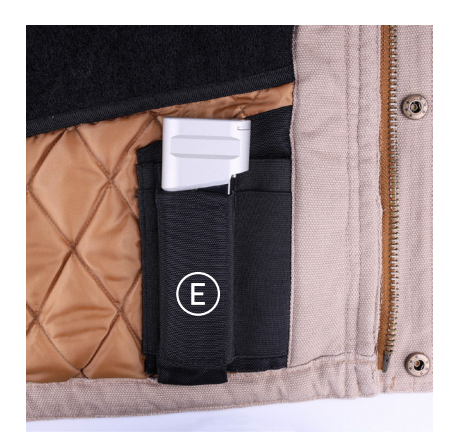
Double Stack Magazine