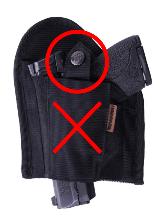
Snap placed too high on firearm