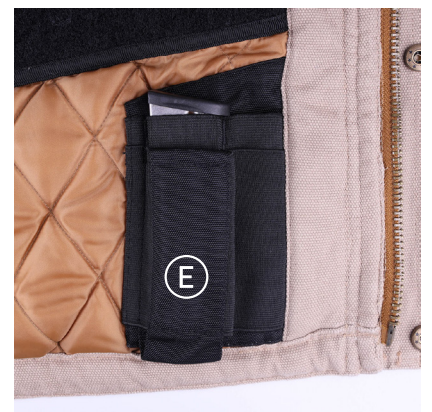
Single Stack Magazine